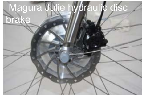
Magura Julie hydraulic disc brake