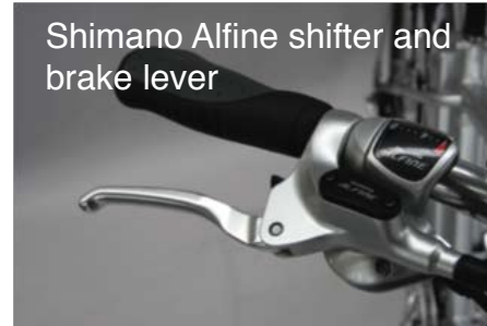
Shimano Alfine shifter and brake lever

Each bike will most likely be customised fitted for the customer for components :- The standard will start with Shimano Deore 9 speed sprockets and Magura Julie hydraulic brakes.