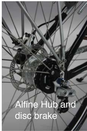
Alfine Hub and disc brake