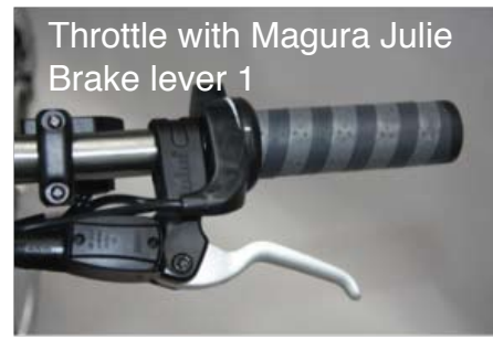
Throttle with Magura Julie Brake lever 1

The spokes will be Aero blades made with stainless steel T302 from Sandvik with exception high tensile and fatigue resistance. Weight of the bike as seen in above photo is 20.3 kgs without battery.