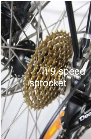
Ti 9 speed sprocket

Each bike will most likely be customised fitted for the customer for components :- The standard will start with Shimano Deore 9 speed sprockets and Magura Julie hydraulic brakes.