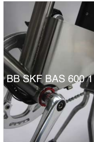
BB SKF BAS 600 1